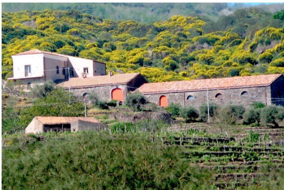
The Passopisciario Winery is located in the Contrada Guardiola vineyard, at around 1,000 metres above sea level.