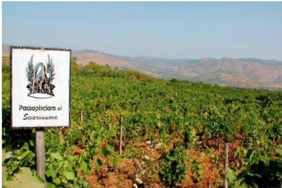
Passopisciaro's Sciaranuova vineyard is located at 850m above sea level, on lava formed in the 1600s.

Le Contrade dell'Etna is an annual wine festival founded by Franchetti in 2007 to celebrate the myriad of sub-regions on the mountain. As each eruption leaves a different mineral profile in its solidified lava fields and can break into different layers of underlying rock, each area has a different signature – although they are actually defined by feudal property borders. Franchetti began bottling his separate contradas in 2008.